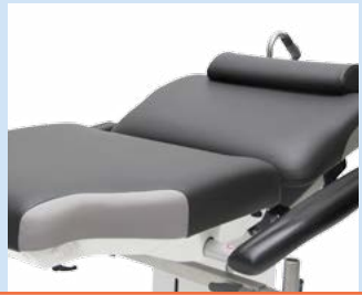
Two-tone comfort upholstery for even more comfortable sitting/reclining positions.