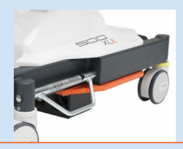
Zinc-primed chassis with anthracite structured finish. Scratch-resistant, hard-wearing, ABS covering in white.